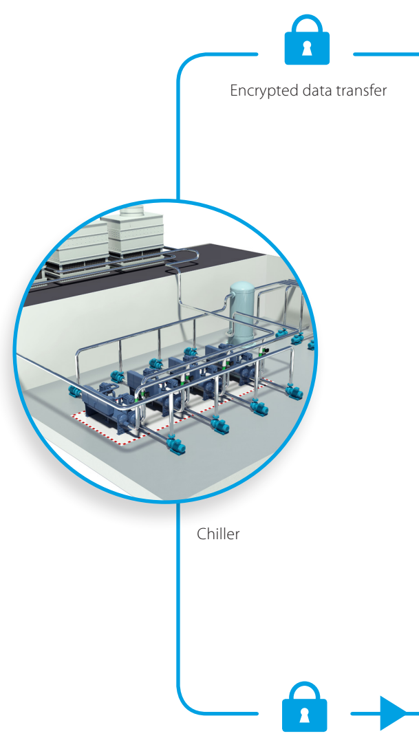
Encrypted data transfer

We will combine Daikin on Site remote monitoring with the complementary service programme best suited to your needs.