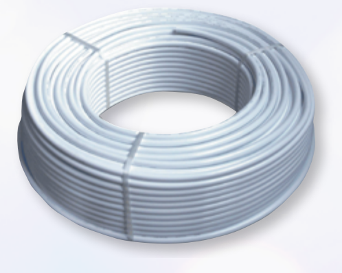
Pipe Dimensional Standard